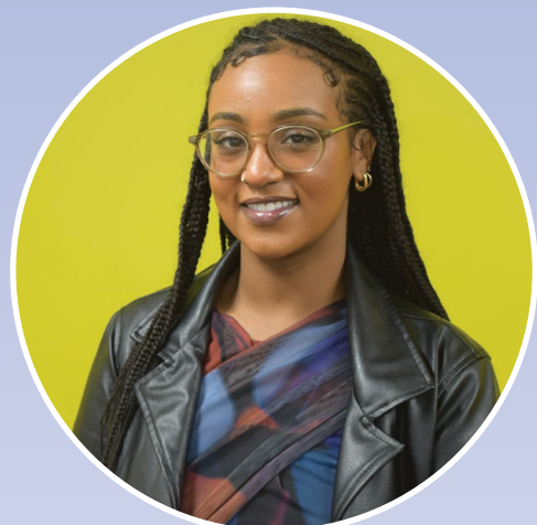
Museum Shumuye, Human Resources Representative