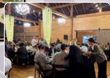
Guests enjoying the evening