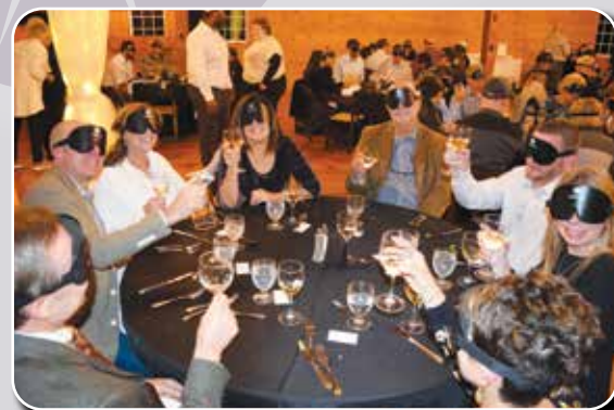
Toast of the town