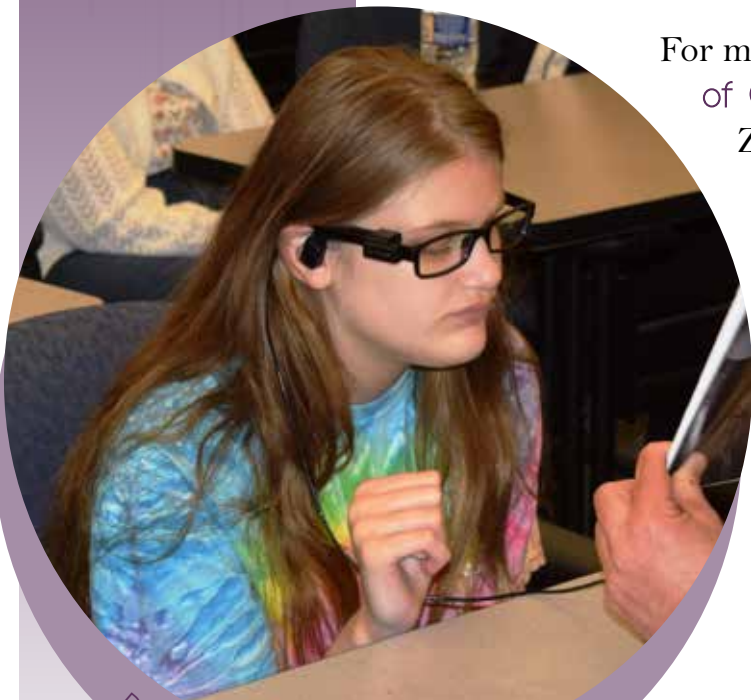
Demonstration of Orcam Technology