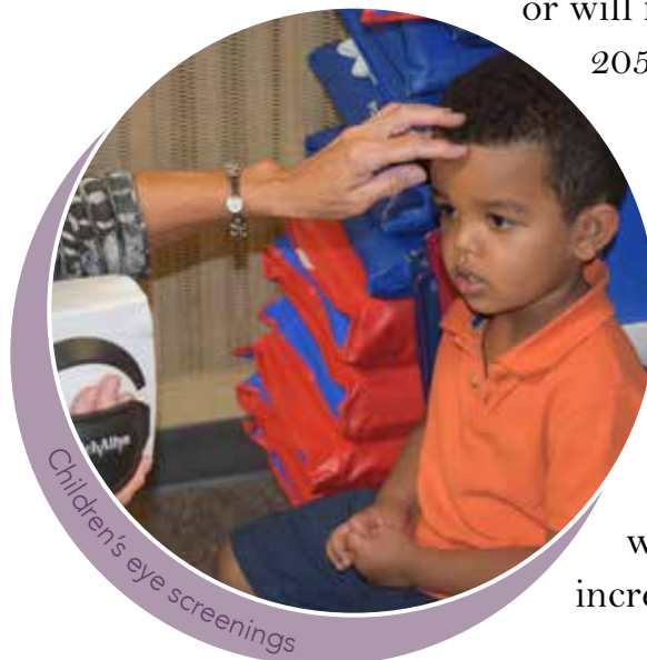
Children's eye screenings

Estimated numbers of persons who have or have had cataracts will increase from 24.4 to 50 million.