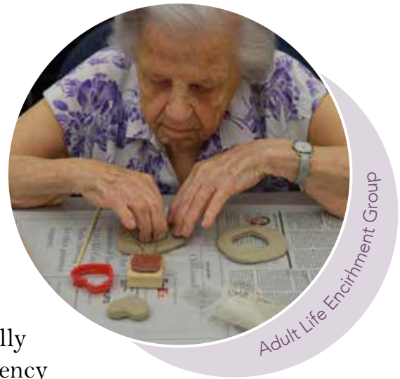
Adult Life Enrichment Group

Vision Resources of Central Pennsylvania (VROCP), formerly Tri-County Association for the Blind, has been working to facilitate independence, enrich the quality of life, and empower individuals who are visually impaired and blind for 98 years. The agency also includes eye safety/prevention programs as part of its mission, educational awareness and employment opportunities for individuals with a variety of disabilities.