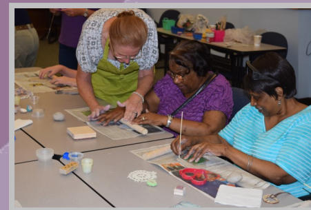
Life Enrichment Group, learning to work with clay

To learn more about this vital organization and how you may be part of its success please call and schedule a tour of the agency facility in Harrisburg. 717-238-2531