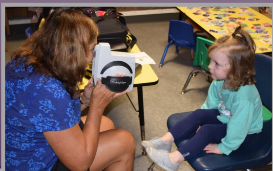
Prevention, preschool vision screening, ready for school